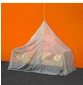
and three shapes